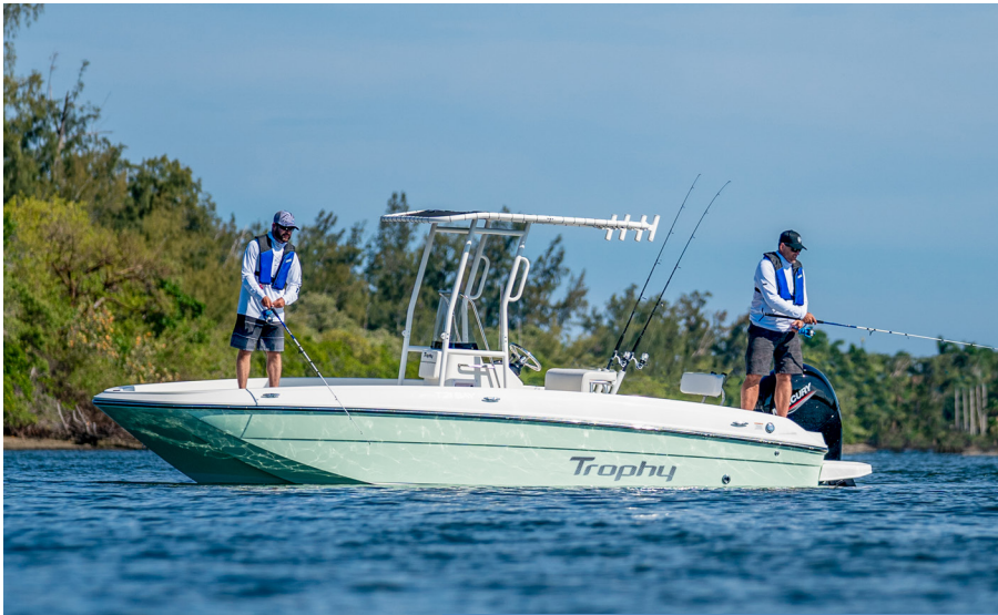
T21Bay Center Console