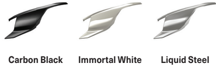
Carbon Black Immortal White Liquid Steel