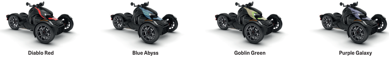
Diablo Red Blue Abyss Goblin Green Purple Galaxy