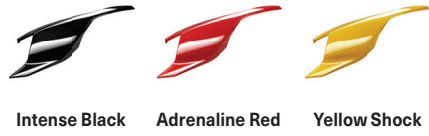
Intense Black Adrenaline Red Yellow Shock