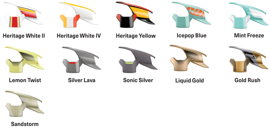
Heritage White II Heritage White IV Heritage Yellow Icepop Blue Mint Freeze Lemon Twist Silver Lava Sonic Silver Liquid Gold Gold Rush Sandstorm