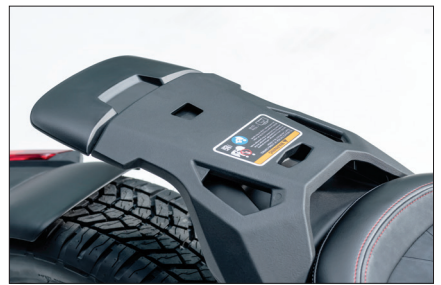
MAX MOUNT STRUCTURE Makes the unit 1+1 ready. It also increases the carrying capacity for different storage options.