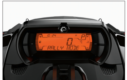
RALLY MODE AND TIRES Allows you to have more flexibility and fun off-pavement by optimizing VSS input and enabling you to perform controlled drifts with adapted all-road tires.