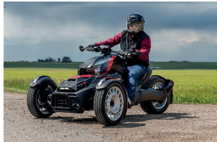
UNIQUE RALLY EXPERIENCE A vehicle designed for all-road trips with hand guards, rally comfort seat for a more reactive rider position and adjustable large anti-slip foot pegs.