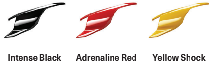
Intense Black Adrenaline Red Yellow Shock