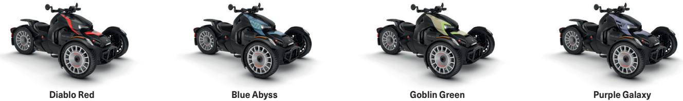
Diablo Red Blue Abyss Goblin Green Purple Galaxy