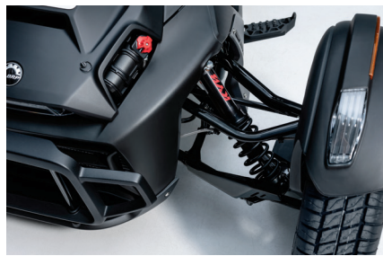
FULL KYB HPG SHOCKS Front and rear KYB HPG shocks with remote adjusters and 1 inch of extra suspension travel to optimize your ride and improve comfort.