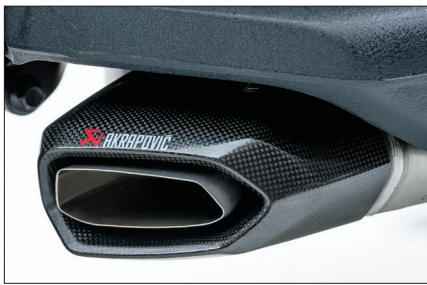
AKRAPOVIČ EXHAUST Unique sound signature and high-end exhaust.